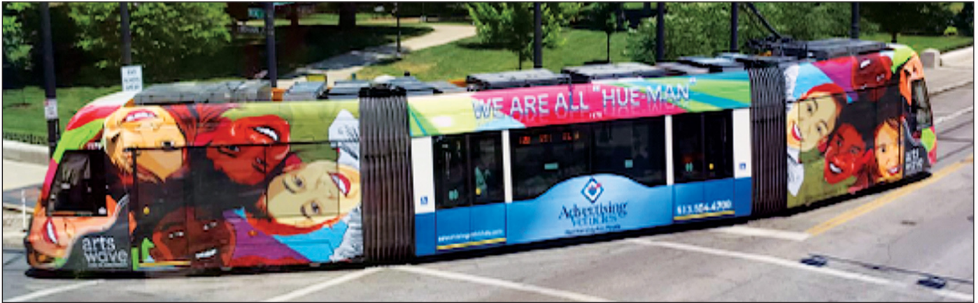
The Connector Streetcar is free to ride around the Cincinnati Central Business District

We are delighted to welcome you to Cincinnati! The 2025 NAME National Convention draws near, and this is the last article about our host city. Let's get back to basics with where we are, traveling here, getting around, and information about the downtown area around the Westin hotel and Fountain Square.