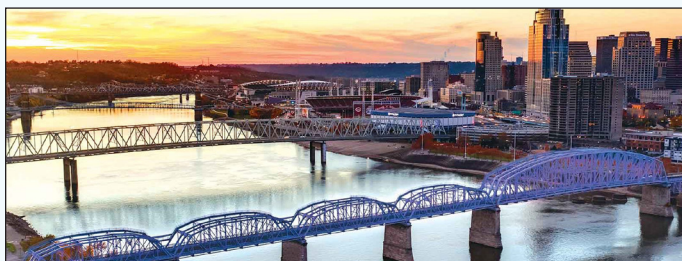
The Cincinnati Skyline from Kentucky. Front to Back: The Purple People Bridge, the Taylor Southgate Bridge, and the John A. Roebling Suspension Bridge.

From the Ohio River Trail one can observe multiple landmarks in Downtown Cincinnati and Northern Kentucky. It runs through Smale Riverfront Park (see more about the park to the right).