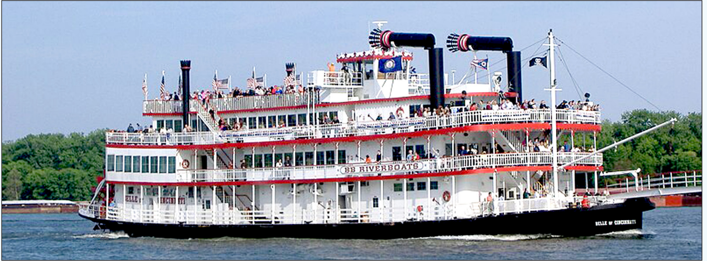
The Belle of Cincinnati Riverboat operated by BB Riverboats, Newport, Kentucky

We've learned about Cincinnati's history, museums near and far, and local cuisine. One might wonder, "What's left to write about?" No worries... We've saved the best for last. These are a variety of just-for-fun activities to consider adding to your agenda when you plan your trip to or from our convention. Note that this series of articles is now available online with clickable links from our club's website at cincy-miniatures.org/index.php/events-2/2025-name-national-convention .