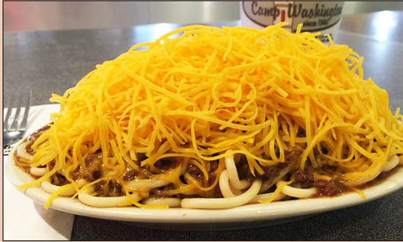
A Hometown Favorite – Cincinnati Three-Way Chili from Camp Washington Chili Parlor