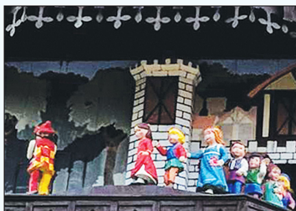
The Pied Piper of Hamlin figures rotate in the Carroll Chimes Bell Tower at Mainstrasse Village, Covington, KY

Feel like you’ve stepped back in time and crossed the pond when you visit MainStrasse Village , in Covington, Kentucky. Encompassing about five blocks centered on the corner of Sixth and Main Streets, the neighborhood features eclectic shops, galleries, music, pubs, and over 98 nearby restaurants. Free parking. ~1.7 mi~ <kentuckytourism.com/explore/mainstrasse-village-2952> and <visitcincy.com/neighborhoods/northern-kentucky/mainstrasse-village>