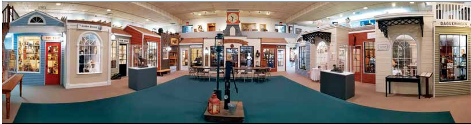
The Village Green, a life-sized replica of an 1800s Town Square at Harmon Museum and Art Gallery in Lebanon, Ohio.

Continuing our compilation of the culture of Cincinnati, this time we're cruising beyond the city circumference to a few sites you might like to visit en route or after your stay. Please go the websites for details. (I will be providing active links in an online version of the articles in the near future.)