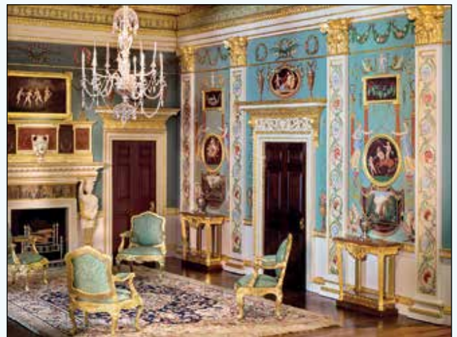
The Painted Room of Spencer House, in the KSB Miniatures Collection

The Glendower Historic Mansion, one of the finest examples of Residential Greek Revival architecture in the Midwest, houses the Harmon Museum and Art Gallery. The museum preserves Southwest Ohio history with its Shaker artifacts, prehistoric artifacts, four art galleries, extensive textile collection, and 1800s (indoor) Village Green. It has an elevator and a museum shop. Open Friday and Saturday only. ~32 mi~ 105 South Broadway, Lebanon, OH 45036 <wchsmuseum.org/harmonmuseum.html>